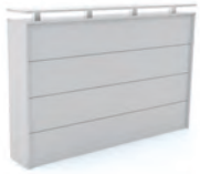
Straight Reception with Top