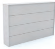
Straight Reception without Top