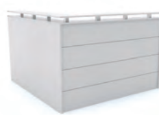
Corner Reception with Top