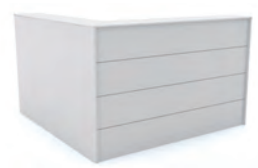
Corner Reception without Top