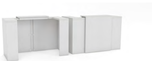
Front and Back View of Reception