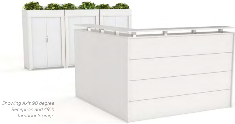
Showing Axis 90 degree Reception and 49" high Tambour Storage

Straight with Top: 41.5"h x 72.5"w x 12"d